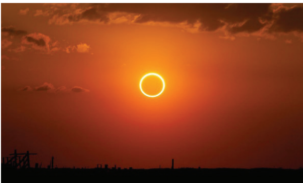
Annular eclipse showing ring of solar surface (ring-of-fire) still visible as Moon passes in front of the Sun

In 2017, many administrators were unprepared when their science teachers asked to take students outside to view the eclipse. So, for the upcoming eclipses, we’ve prepared this document to give you the background you need to help your teachers make the two eclipses an unforgettable learning experience.