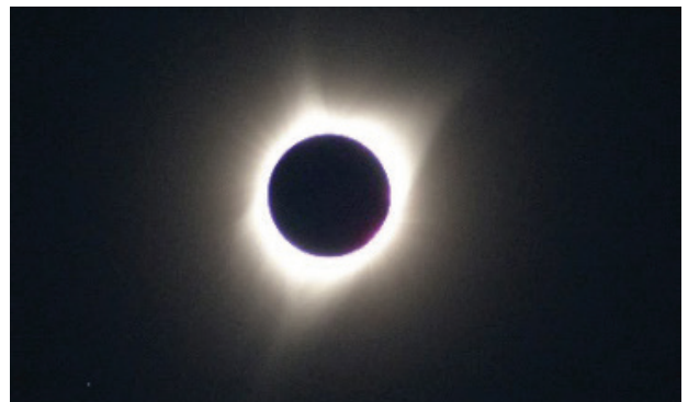
Total eclipse showing solar corona as the Moon passes in front of the Sun and completely covers the Sun's surface

during August 2017 Eclipse