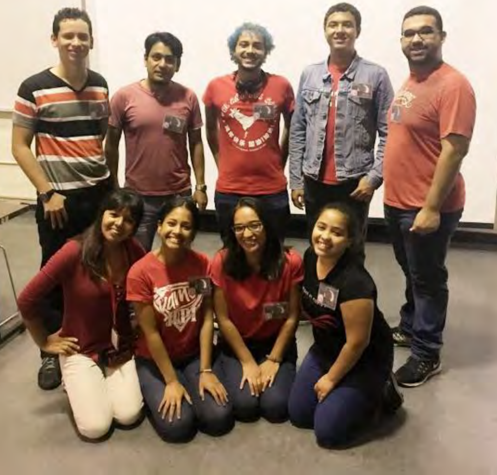
Students at UPR-RP: Starry Messengers

Preparation of College level students the semester before the eclipse