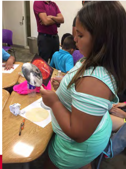
Astronomy at Summer Camp at Caribbean University, June 2017

Identify activities and lessons in Spanish. Use adapted materials for the visually impaired