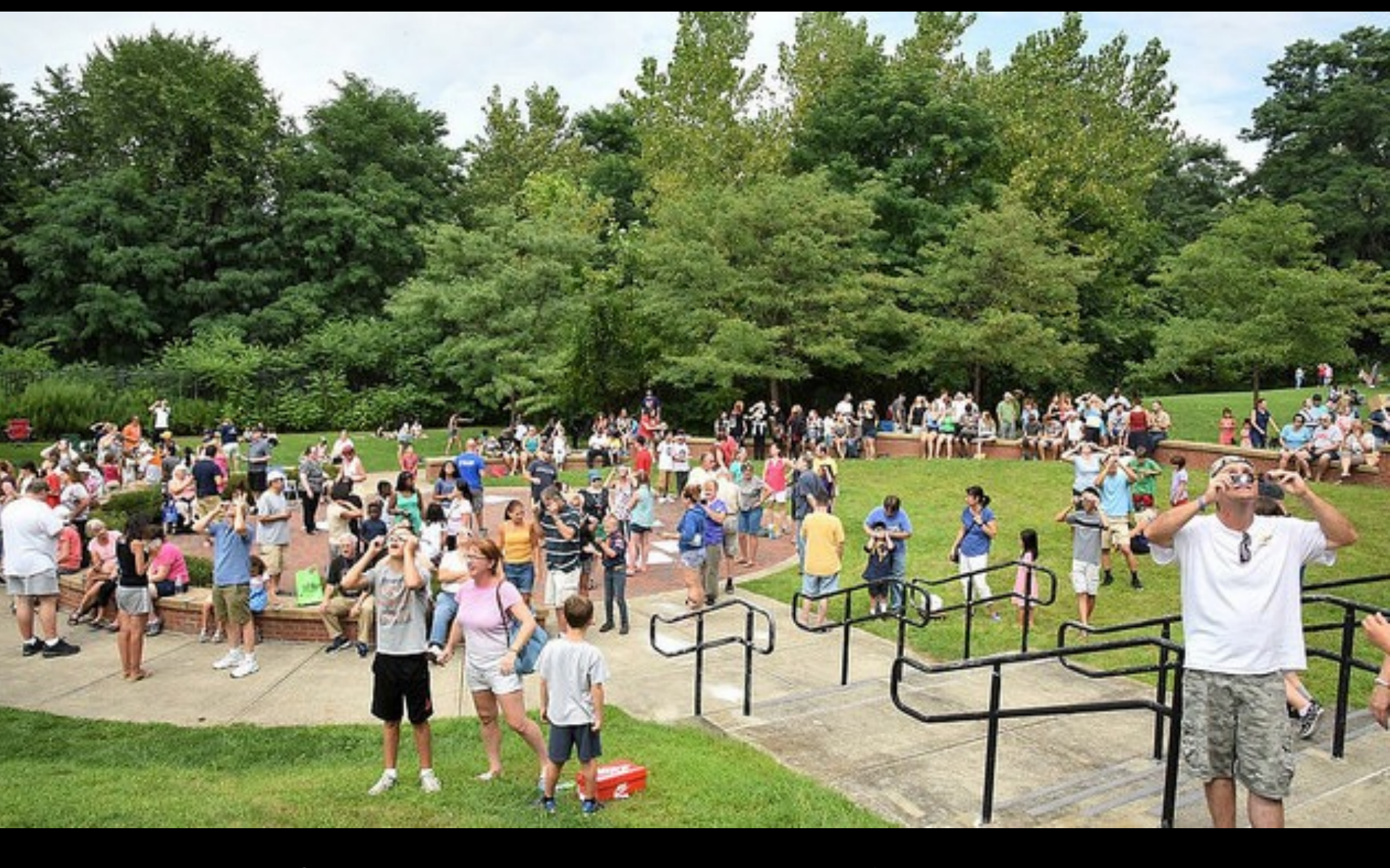
Look for to Large Crowds at Libraries on Eclipse Day – And Before