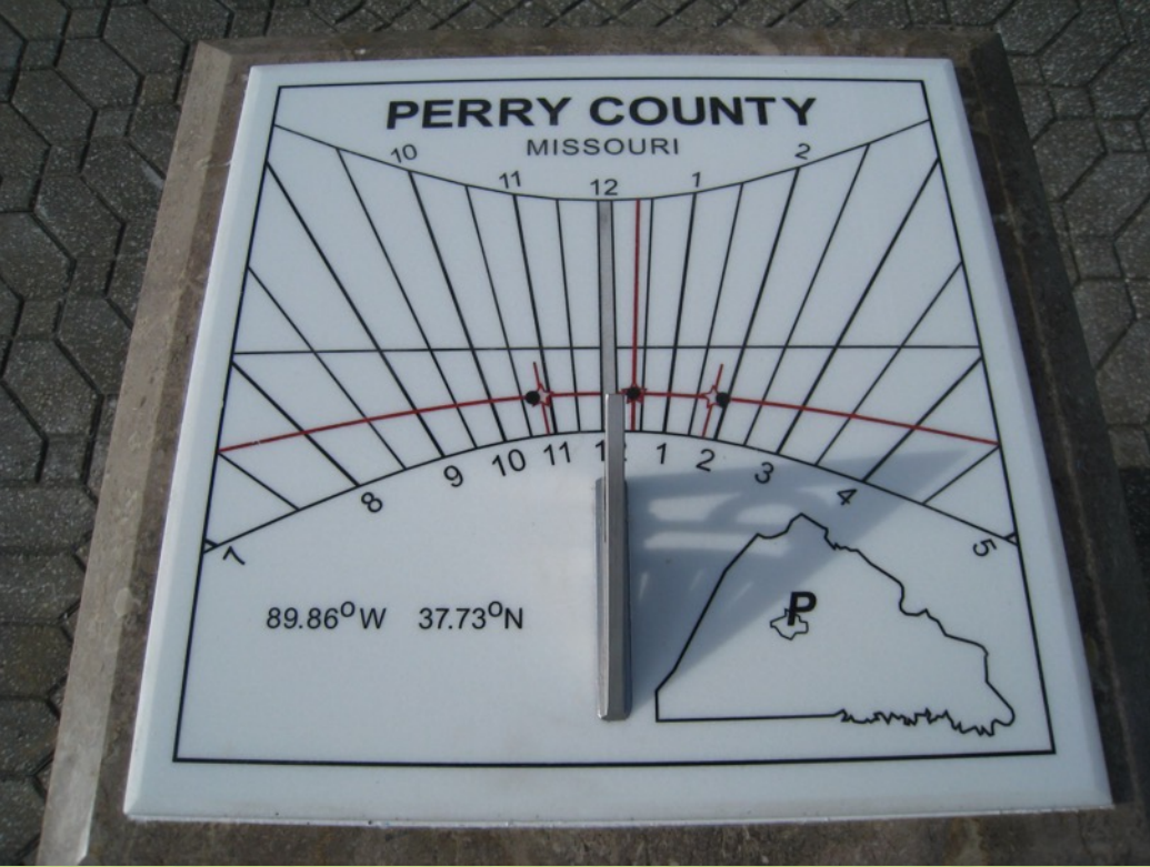
Perry County Commemorative Eclipse Sundial 2017/2024