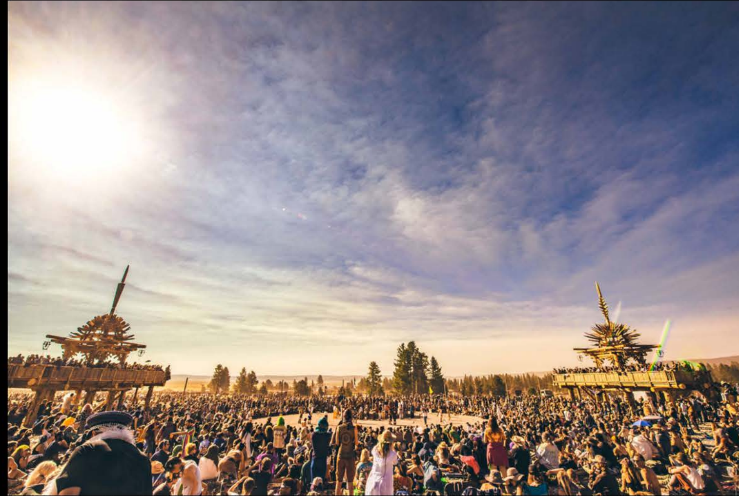
The Symbiosis Gathering 2017 at Big Summit Prairie near Mitchell, OR is said to have brought 30,000 people together for a week-long event culminating in the Totality experience.