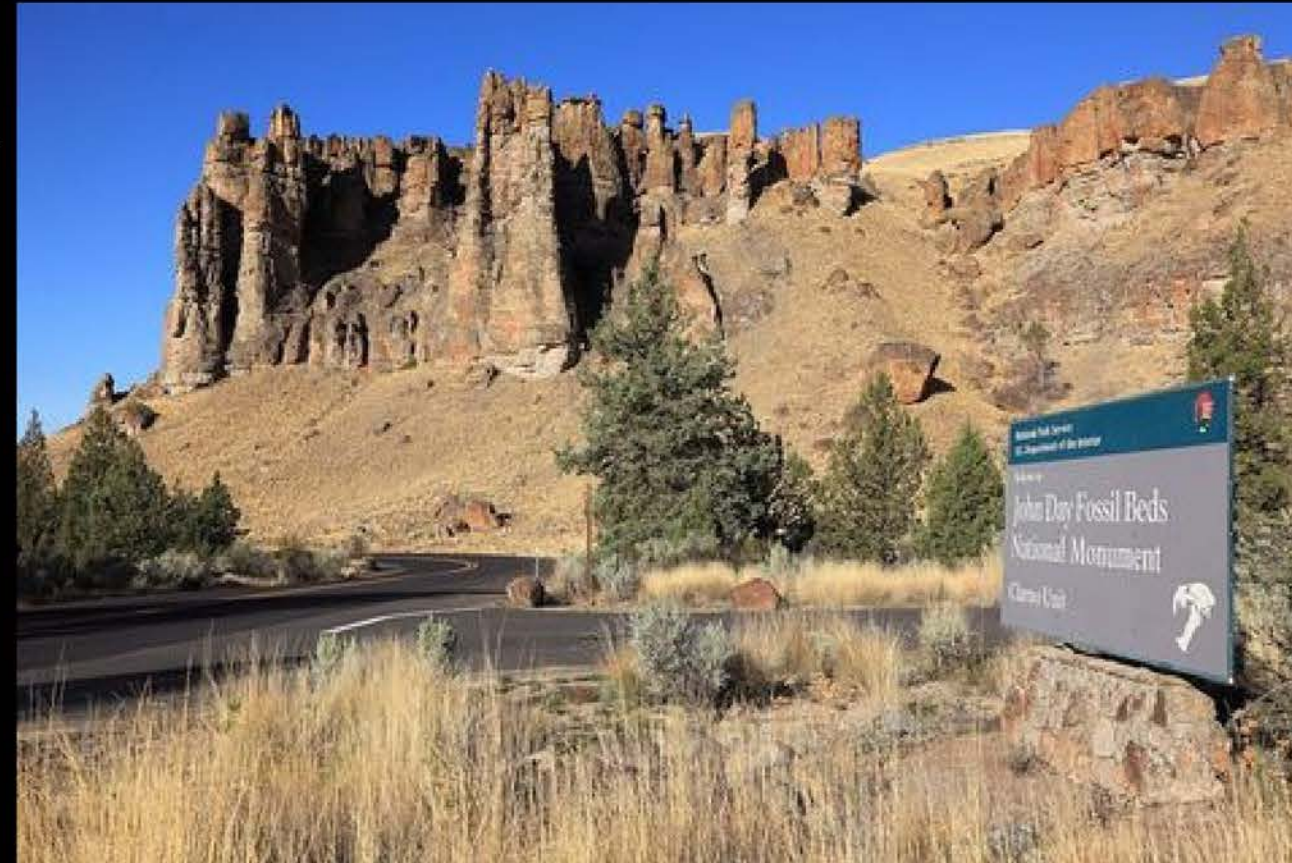
John Day Fossil Beds NP – an ideal quiet, serene place to experience the Eclipse. Help is only hours away, and that's AFTER you hike and drive hours to get to cell service